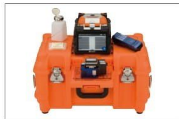
Carrying case with worktable CC-82