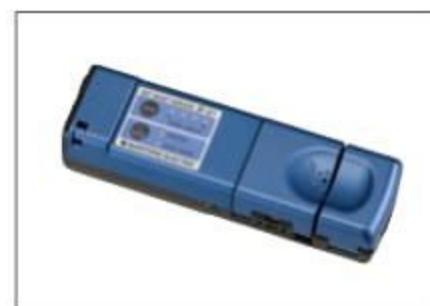
Hot jacket remover JR-6+