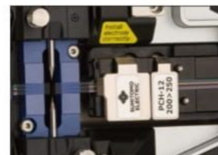
Pitch changing holder PCH-12