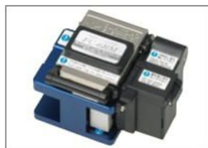
Table-top cleaver FC-6 / FC-6R series