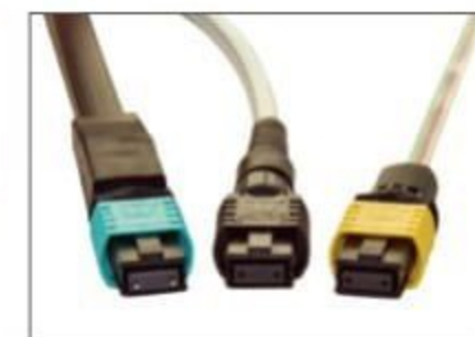
Available for Lynx-Custom Fit™ Splice-On Connector