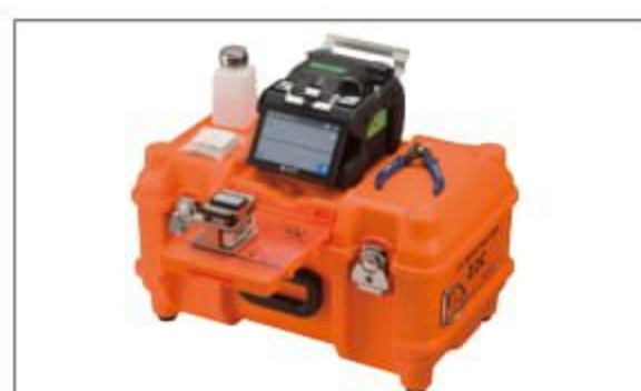
Carrying case with worktable CC-82