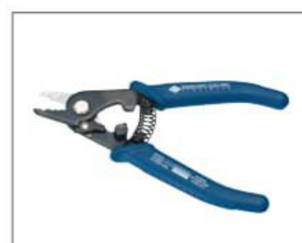
Jacket remover JR-M03