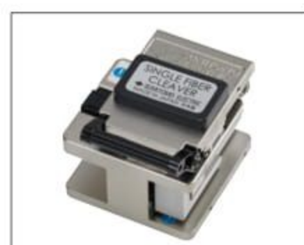
Table-top cleaver SFC-S