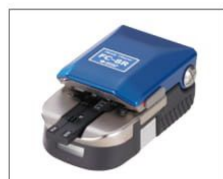
Handy cleaver FC-8R series